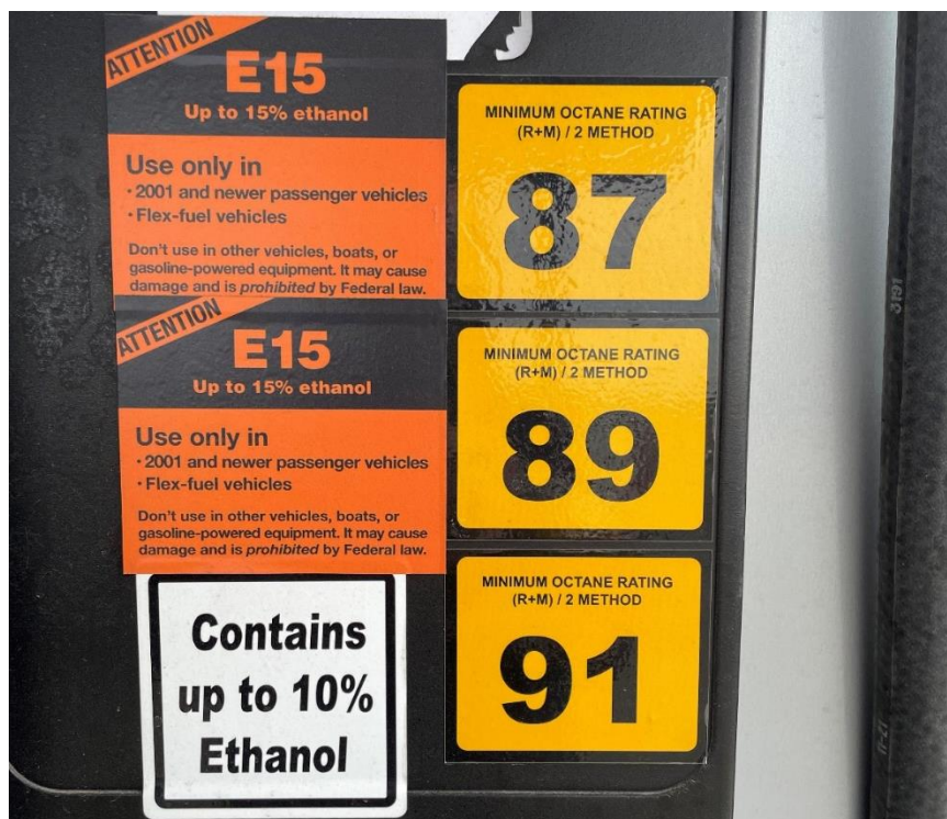
Exhibit 3: Pump Labels at Midwest Retail Station Offering 87-AKI Regular E15

rulemaking (vacated in 2021 by the D.C. Circuit Court of Appeals) and a series of emergency waivers issued by EPA in 2022. There is considerable uncertainty at the moment whether there will be parity in the treatment of E10 and E15 during the 2023-2025 timeframe. (This is not an issue in the wintertime or for reformulated gasoline areas.) As EPA noted in the DRIA, a group of Midwest governors petitioned the Agency in 2022 to forgo the 1-psi waiver, which would result in the same BOBs being used for E10 and E15 in those states. Additionally, there is a new legislative push supported by both renewable fuels and petroleum organizations, including RFA and the American Petroleum Institute, that would permanently provide equal regulatory treatment for all gasoline blends containing 10% ethanol or more, including E15.